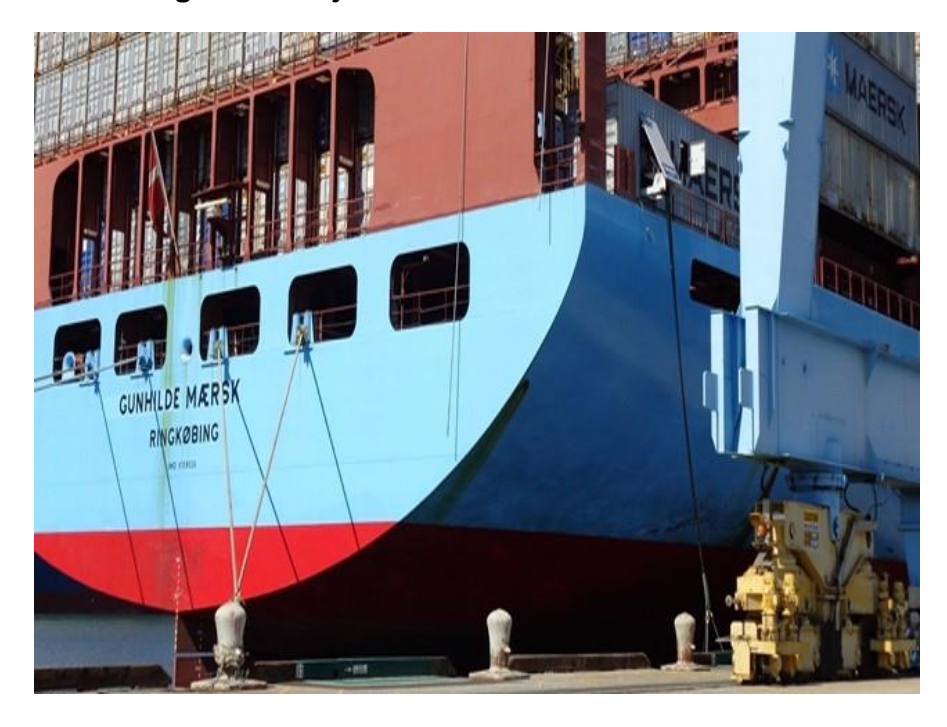
Figure 5: Project Vessel "Gunhilde Maersk"

These ships are part of Maersk Line's $125 million Radical Retrofit Program (Radical Retrofit), which retrofitted existing vessels with multiple energy efficiency technologies, such as redesigning the bulbous bow of each vessel, replacing existing propellers with more efficient models, adding propeller boss cap fins to reduce the inefficiencies associated with the shearing of water at the end of the propeller, and "derating" the main engines to make them more efficient at lower speeds.