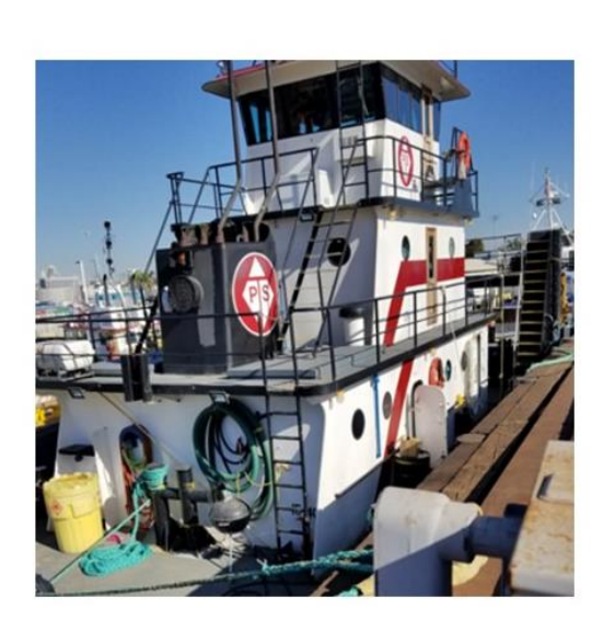
Figure 6: Nett Technologies Demonstration Vessel and BlueMAX NOVA System