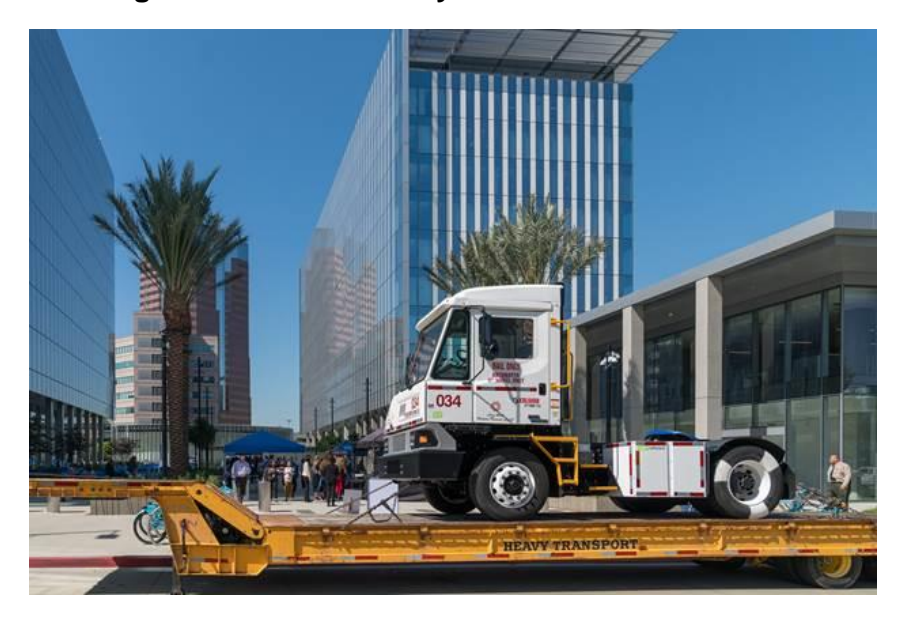
Figure 3: Kalmar Battery-Electric Yard Tractor

The TransPower EVSE to support the Kalmar battery-electric yard tractor was commissioned in the second quarter of 2019, and there have been no issues. The Kalmar yard tractor was delivered shortly thereafter, and the demonstration began in July 2019. The terminal operator, LBCT, has reported being very pleased with the tractor.