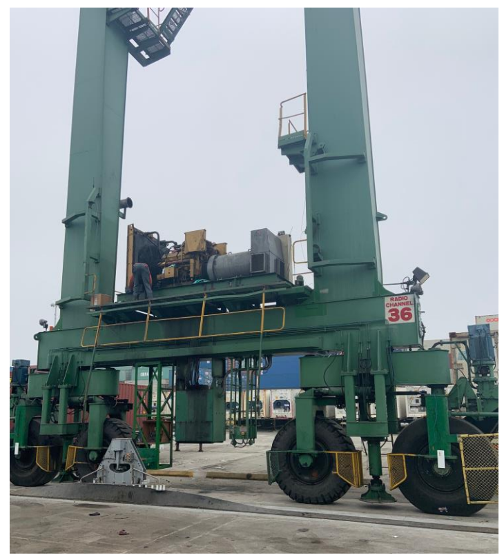
Nine diesel RTGs are being repowered from diesel to full electric under the Zero Emissions Terminal Transition Project. See Section 5.17.

Specifically, the Ports are providing indirect support for SCAQMD's new partnership with Volvo Group North America (Volvo) under a CARB grant, the Volvo Low Impact Green Heavv Transport Solutions (LIGHTS) Project. Under this project, Volvo and its partners will develop project demonstrate over 50 on- and off-road zeroemission truck and equipment with associated infrastructure and solar power. The Ports are contributing expertise and inkind labor.